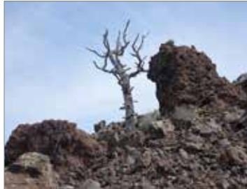
Limber pine at Craters of the Moon National Monument