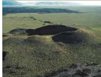
Aerial view of Craters of the Moon National Monument