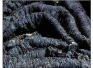
Lava tubes at Craters of the Moon National Monument