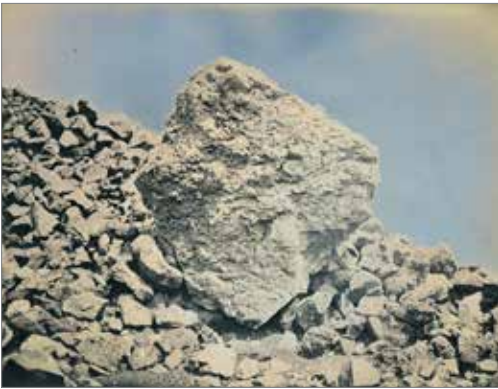
Binh Danh, Cinders at Craters of the Moon , 2013, original camera-exposed daguerreotype, courtesy the artist and Haines Gallery, San Francisco

Three additional artists will also participate in the Ketchum exhibition.