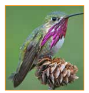
CALLIOPE Calliope Hummingbird