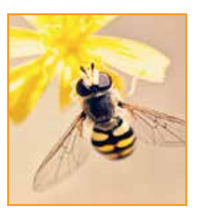
BEATRICE (BEA) Honeybee