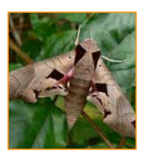
SPHINX Achemon Sphinx Moth