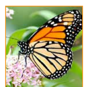
MARI Monarch Butterfly